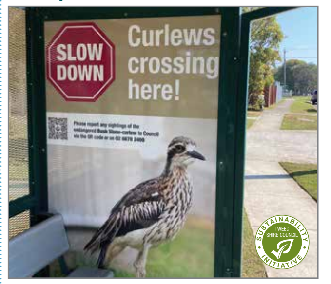
New bus stops signs at Kingscliff call for residents and visitors to protect and report endangered Bush Stone-curlews.

Report all sightings of endangered Bush Stone-curlews at tweed.nsw.gov.au/bush-stone-curlews