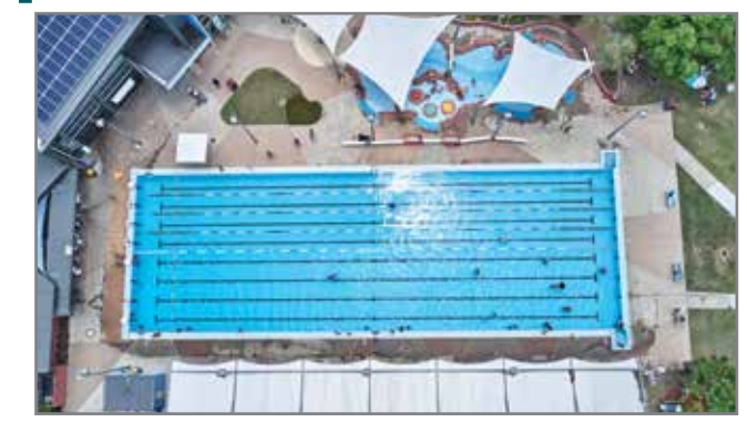
Tweed Regional Aquatic Centres at Murwillumbah (pictured), Kingscliff and South Tweed have reopened with restricted hours.

Keep up to date with closures and service impacts on Council's COVID-19 Emergency Dashboard – at the top right of our home page <a href="tweed.nsw.gov.au">tweed.nsw.gov.au</a>