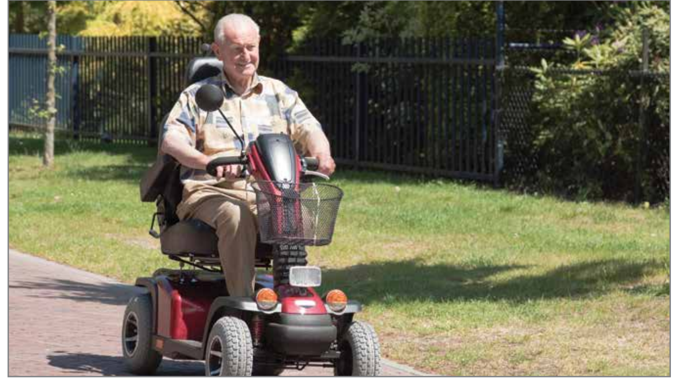
Tell Council your thoughts and ideas on new or upgraded pedestrian pathways and facilities.

Council wants to hear from you where you think new or upgraded pedestrian pathways and facilities would allow safer travel and improve connections between places, shops, services and activities.