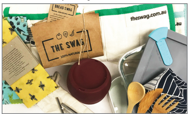
Some plastic-free ideas to inspire you in Plastic Free July.

Council is joining the solution to plastic pollution by participating in the Plastic Free July challenge.