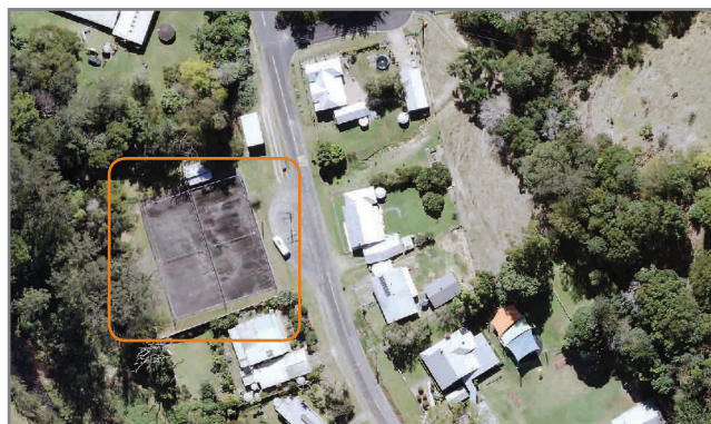
Chillingham tennis courts (highlighted) to get a makeover.

Council officers will host a community information session at Chillingham Public Hall on Monday 28 June to discuss the concept plan and answer any questions.