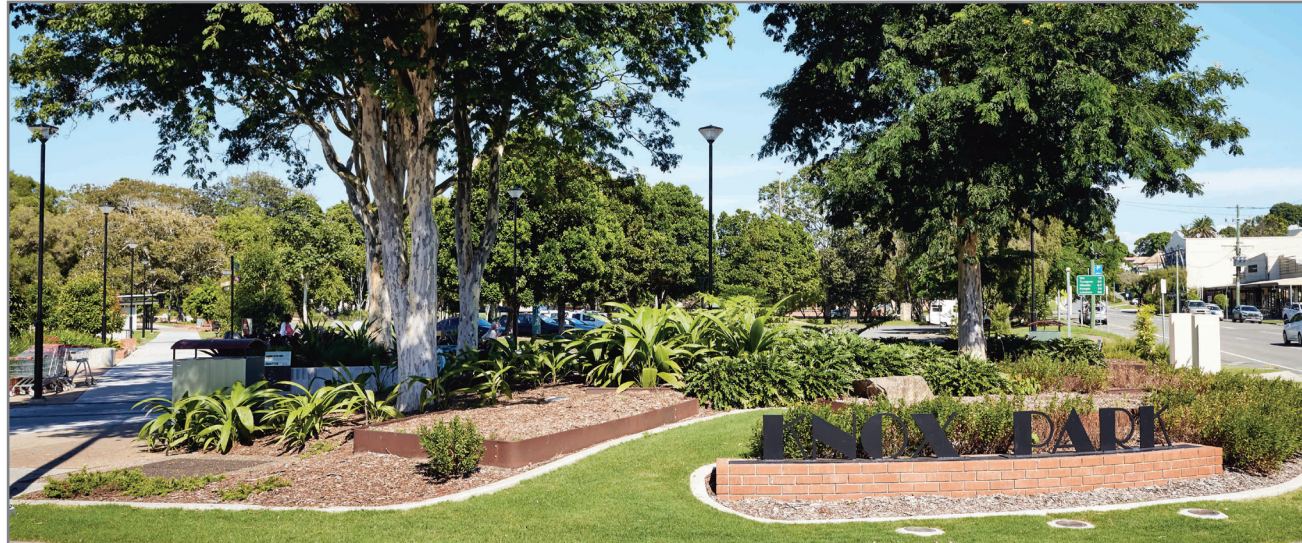
The new entrance to the award-winning Knox Park in Murwillumbah.

Tweed Shire Council wishes to recognise the generations of the local Aboriginal people of the Bundjalung Nation who have lived in and derived their physical and spiritual needs from the forests, rivers, lakes and streams of this beautiful valley over many thousands of years as the traditional owners and custodians of these lands.