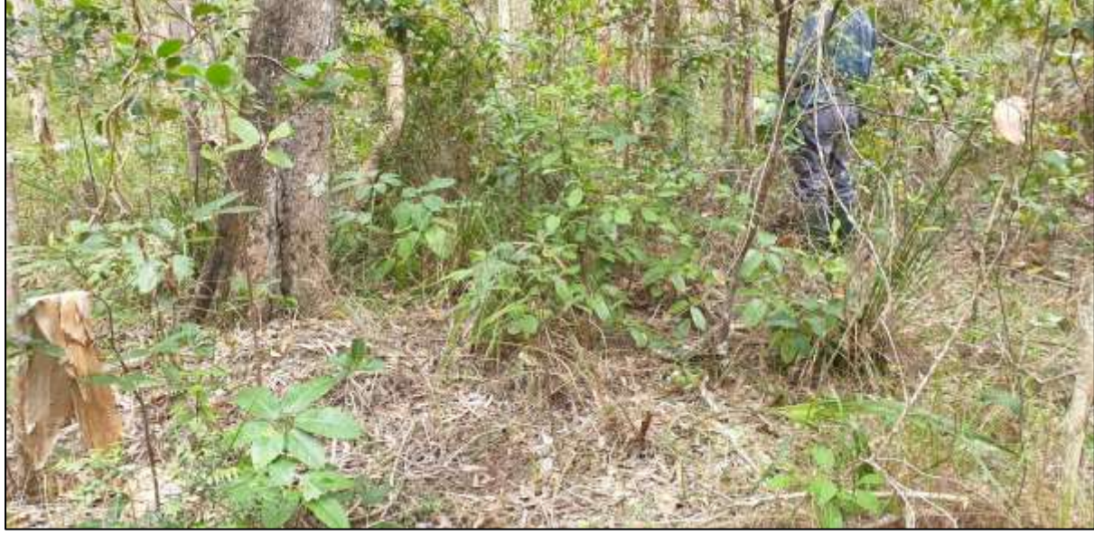
Plate 6 Tongue - patches of juvenile Umbrella Trees were controlled during maintenance

Maintenance was undertaken late 2018. Control of woody weeds such as Giant Devils Fig, Tobacco, Lantana and Winter Senna was required prior to spray of exotic grasses. Follow-up spot spray through most of the zone was repeated in August 2019. Native groundcovers have increased and regeneration of trees is evident. An infestation of Coastal Morning Glory on the western edge near the gate has responded well to treatment.