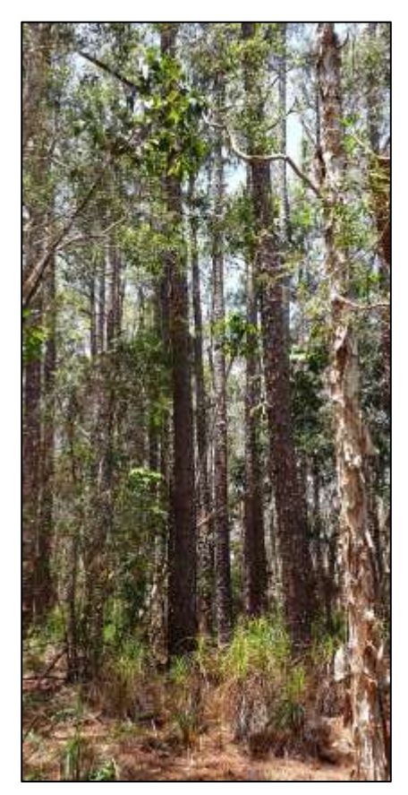
Plate 4 Macadamia South - dense Slash Pines are controlled by drill and injection

drought. Dense Winter Senna, Lantana, Slash Pines have been manually controlled progressively over a large part of the zone while the opportunity is presented.