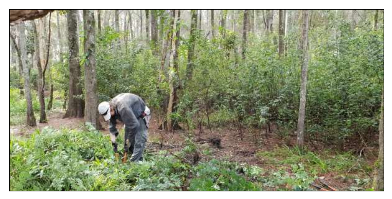
Plate 3 Macadamia South - bush regenerators work through dense Winter Senna dominating much of the midstory

Extensive primary control of woody weeds has been undertaken in 2019. This area connects to Entrance South and Lower Grey Gum Gully. Very dry conditions have allowed access into swampy areas and almost eliminated the formidable presence of mosquitoes, a positive effect of the