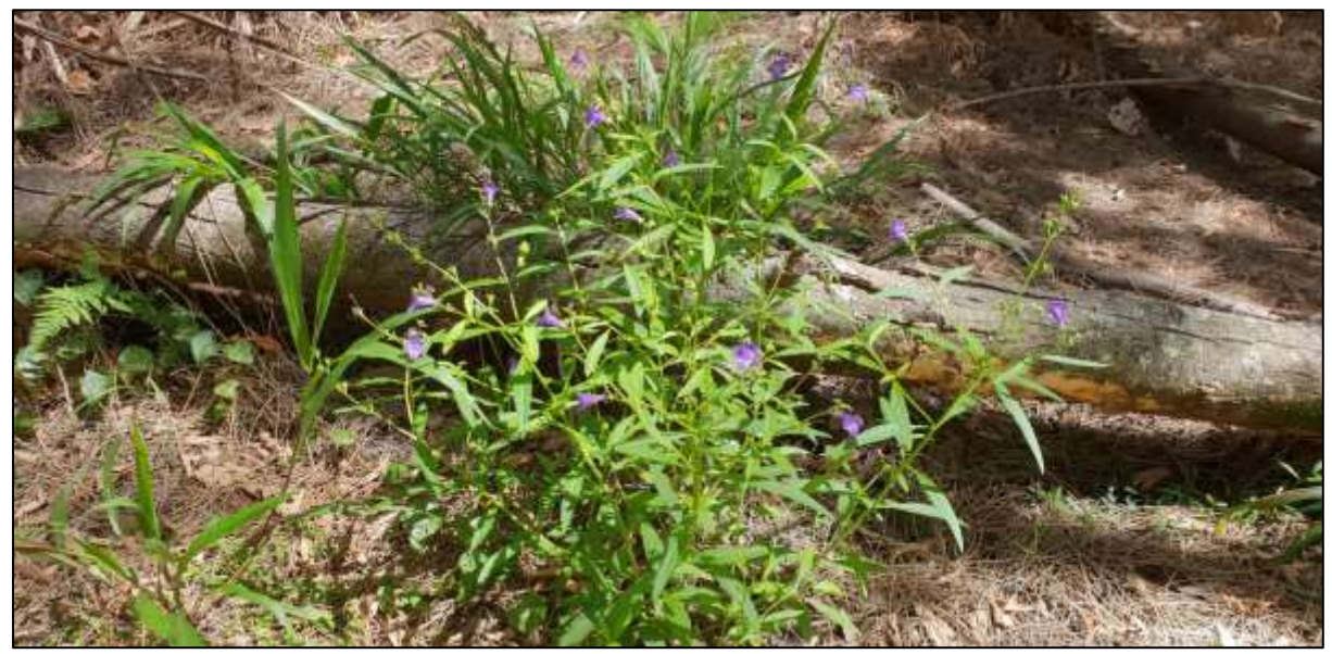
Plate 2 Lower Grey Gum Gully - native groundcovers like 'Koala Bells' benefit from control of exotic grasses

Maintenance through "Lower Grey Gum Gully" in August 2019 was timely to control regrowth of Winter Senna, Giant Devils Fig and Lantana around the pond on the lower edge of the zone. Passionflower species and exotic grasses were treated in this area and throughout the rest of the zone. Some outbreaks of Coral Creeper are treated along the south-east edge of the zone.