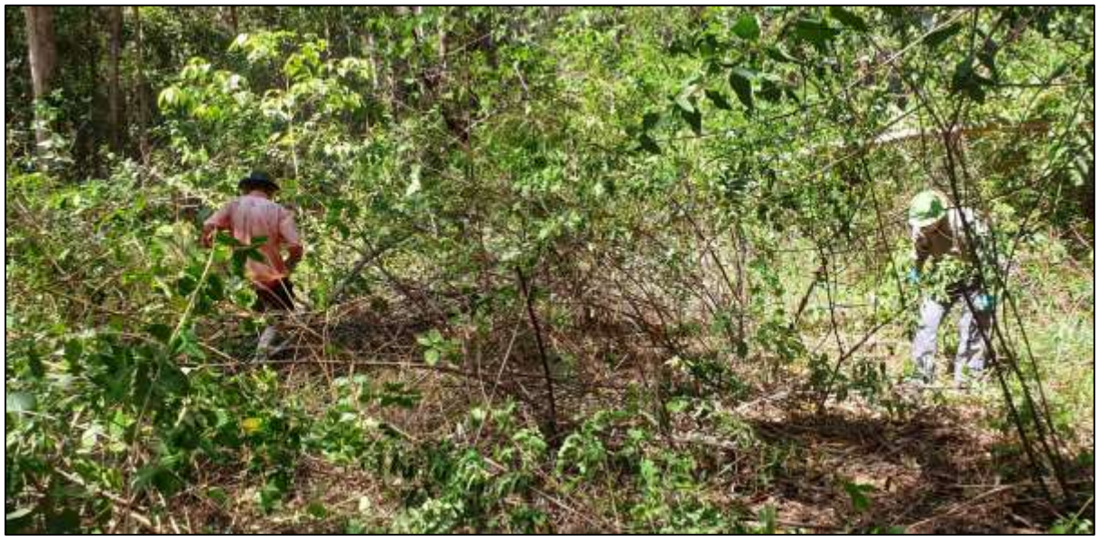
Plate 7 Barrage - bush regenerators manually control tangled Lantana and Winter Senna

Primary control of weeds was undertaken during September and October 2019. Dense sections of Lantana and Winter Senna were controlled manually. Exotic grasses were cleared around small natives and sprayed. Extension of primary control of weeds to meet with planting areas adjacent will enhance regeneration and planting projects.