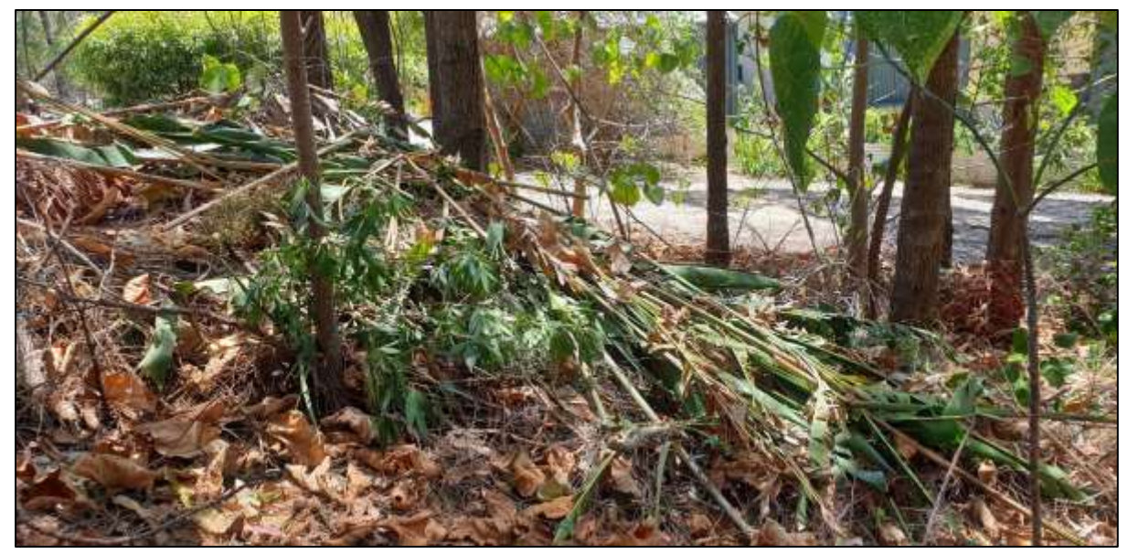
Plate 1 Glossy - Garden dump piles behind houses on Lomandra Avenue

Maintenance runs were completed in late 2018. Native groundcovers have expanded into areas once dominated by Setaria, Broadleaf Paspalum, Molasses Grass and Rhodes Grass. Brush Box, Forest Oak and other native species have established amongst native groundcovers. Considerable disturbance has occurred during construction of a mountain bike track along the north east ridgeline. Two Glossy Black Cockatoos were observed during works. A follow-up spot spray was commenced along the lower slopes in October 2019. Dumping of garden waste was observed and bush regenerators spoke to the resident and explained this was not acceptable. Follow-up literature of council policy is yet to be delivered by bush regenerators.