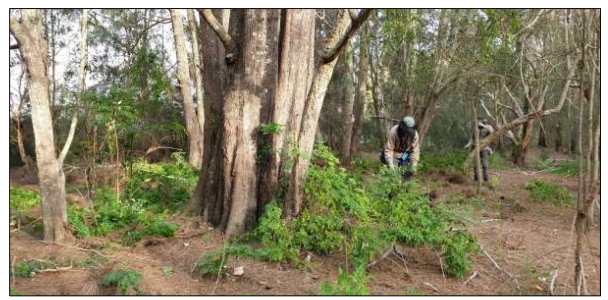
Plate 5 Creek - larger Climbing Nightshade was treated manually prior to spot spray

Thirty days were used for primary work and three days follow up in this zone.