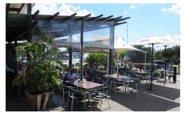
Marine Parade has a distinct high street retail experience with a restaurant and cafe niche.