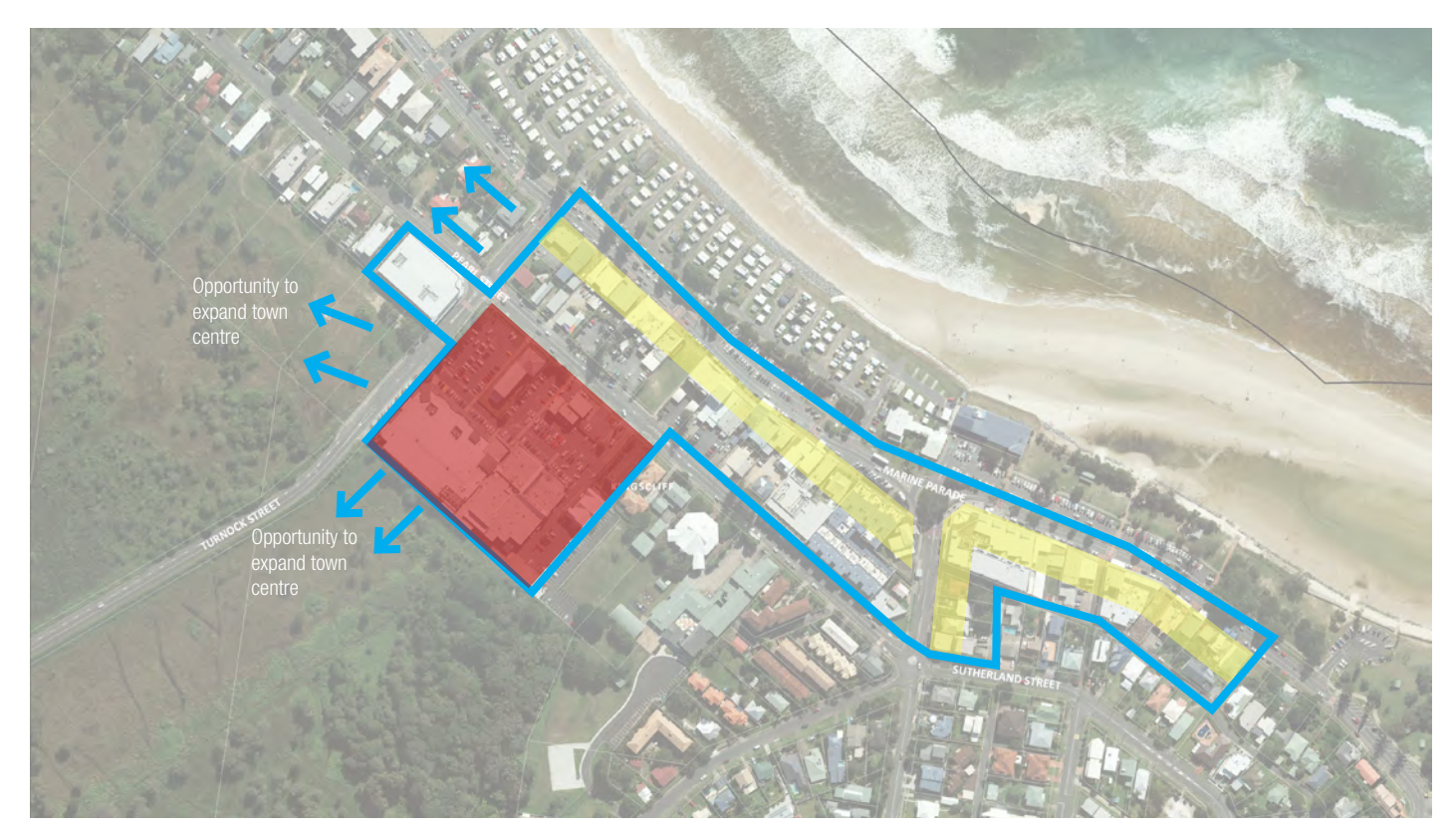
Figure 5.1 Kingscliff Town Centre Core is centred around Marine Parade, Pearl and Turnock Street with two difference character areas; the open 'high street' character of Marine Parade and the Kingscliff Shopping Village which is an internal shopping mall.