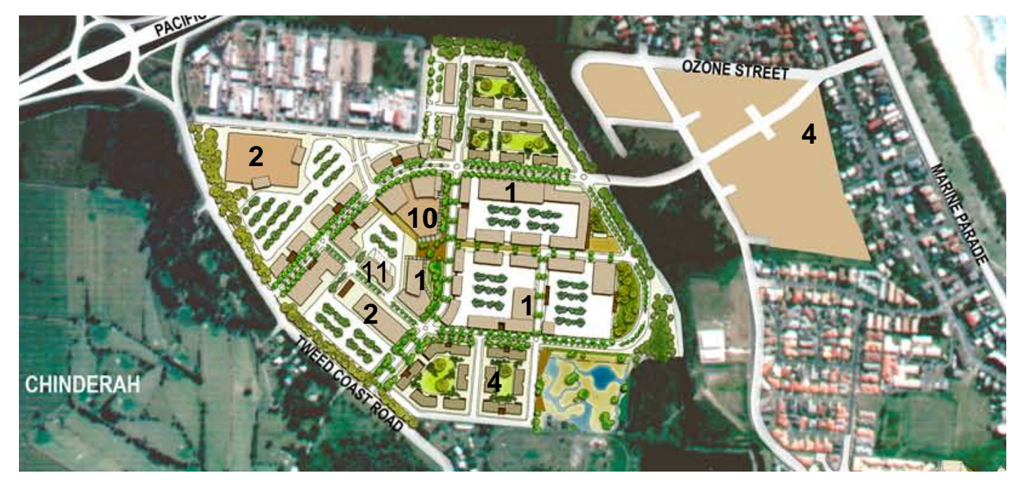
Figure 5.3 In 2007 and 2016 Gales Holding produced a masterplan for discussion and consultation over key development sites in Kingscliff. This north Kingscliff site explored a mix of district centre functions, (30,000 sqm) light industrial and bulky goods uses (40,000 sqm) with open space and residential land uses.

In the intervening period the South Tweed Retail Centre has expanded, with approved staged plans to expand retail and commercial floor space even further. This will undoubtedly assert the South Tweed as the regional retail centre fulfilling the higher order regional city role. In doing so there will be a need to revisit the seven retail strategies and provide recommendations in order to reconcile the applicable planning framework to guide Tweed Retail Centres hierarchy.