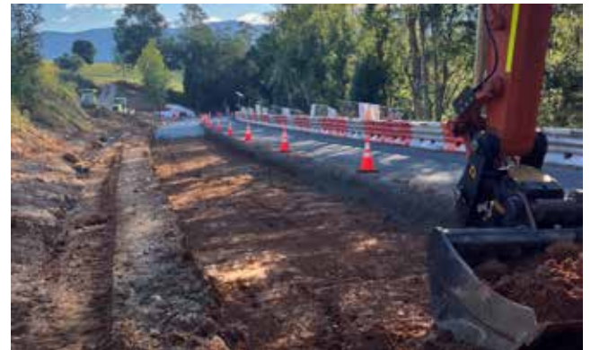
Tyalgum Road Slip site repair works are currently underway.

The project is expected to be completed by late May or early June 2025.