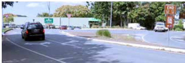
Alma Street, South Murwillumbah set to get a glow up.

Exciting upgrades are on the way for Alma Street, South Murwillumbah, with improvements starting Wednesday 7 May 2025. The works will improve drainage, safety and give the street a much-needed refresh – all part of Council's commitment to enhancing local infrastructure.