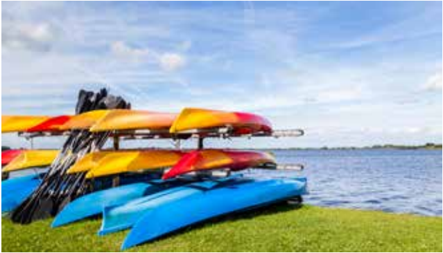
Ahoy water sports enthusiasts... check out these water toys!

equipment for hire, promoting safe and enjoyable recreation across Tweed’s waterways.