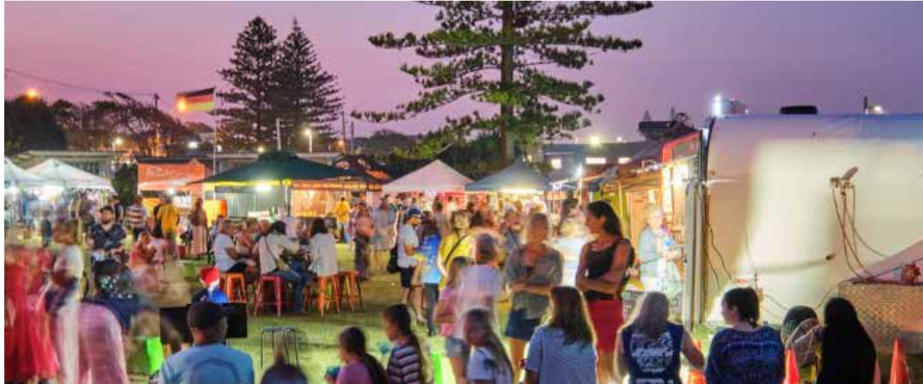
Roll up roll up... Got an upcoming event or an idea for an event? Tell us all about it, and you might be eligible for sponsorship.