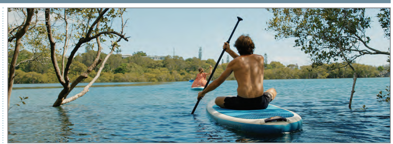
Paddling on one of the Tweed's many pristine waterways is a great way to explore the coastal region.