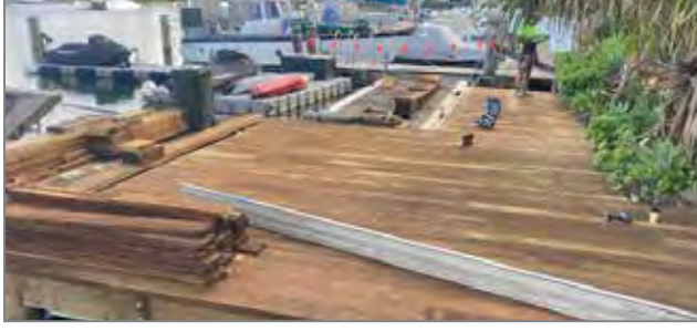
Substructure and new deck on the first landing section of the Jetties Boardwalk.