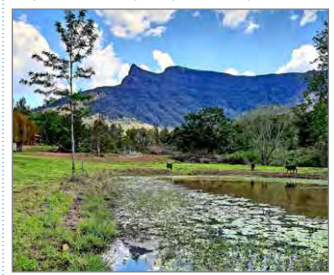
The field day for Tweed farmers will be hosted at a property at Pumpenbil, part of a larger project to build drought-resilient beef and dairy farms in the Tweed.

Registrations are essential and places are limited. To find out more or register, visit tweed.nsw.gov.au/agriculture-farming