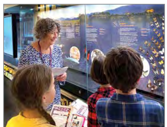
The Tweed Regional Museum is holding an Open Night next Tuesday 24 May at 5pm for anyone interested in the Museum's volunteer Ambassador program.

National Volunteer Week (16 - 22 May) is a chance for us to celebrate and recognise the vital work of volunteers and to say thank you.