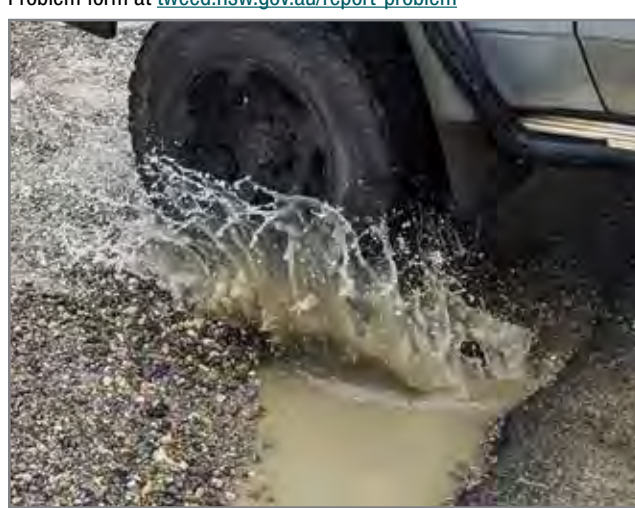
More potholes have formed over the wet weather period and are difficult to repair while it remains wet.

Residents are urged to report any potholes via Council's Report A Problem form at tweed.nsw.gov.au/report-problem