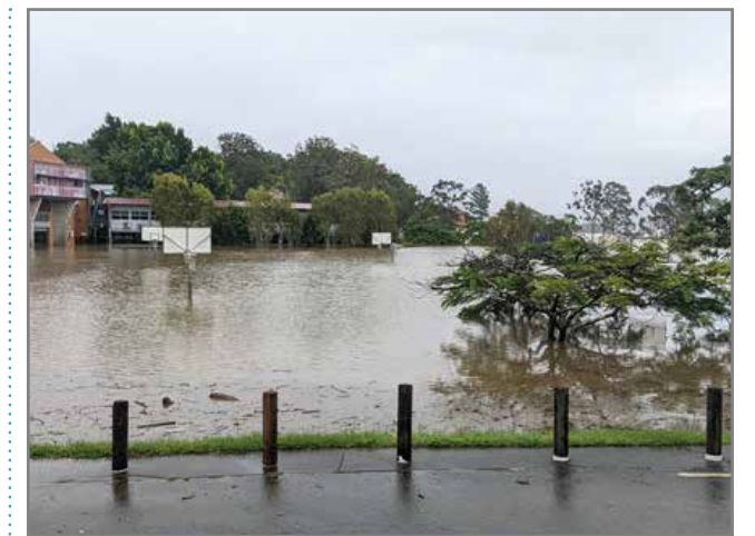
Floodwater may look tempting to swim or play in but you don't know what's lurking in there.