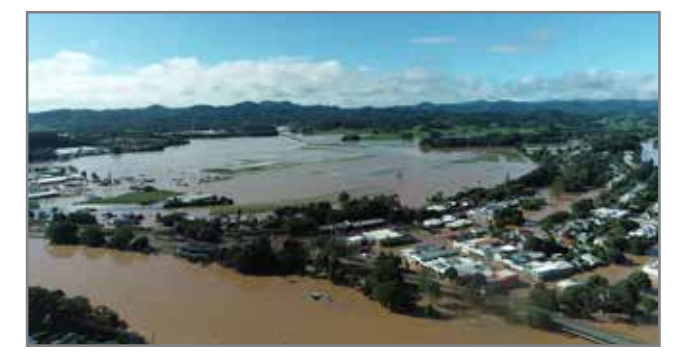
Tweed River and South Murwillumbah.