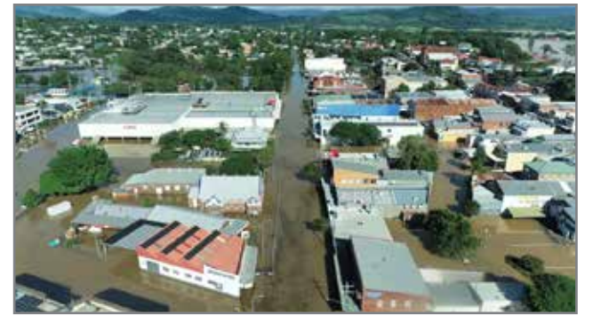
Wollumbin Street, Murwillumbah.