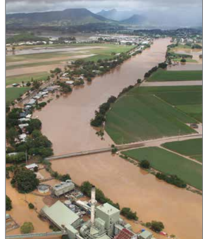
Condong looking towards Tumbulgum.