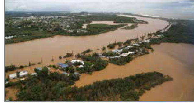
Fingal Head, Wommin Lake with Tweed Heads in the background.