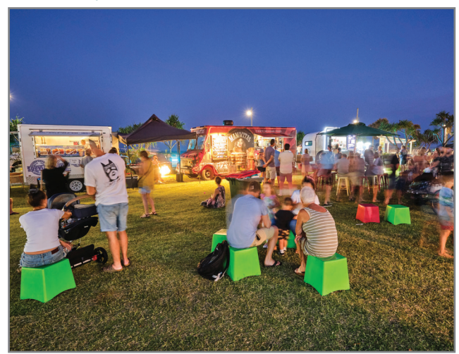
Come along to learn about what you need to operate a mobile food business in the Tweed.

Mobile food vendors, market operators and event organisers are invited to register for the event, which runs from 4 to 5:30 pm at eventworkshop-foodvans.eventbrite.com.au