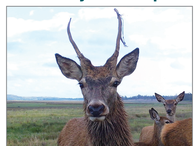
Workshops will be held at Tyalgum and Murwillumbah to address the looming threat of feral deer encroaching on the Tweed.

The first in a series of free community workshops to discuss the looming threat of feral deer establishing in the Northern Rivers will be held at Tyalgum on Friday.