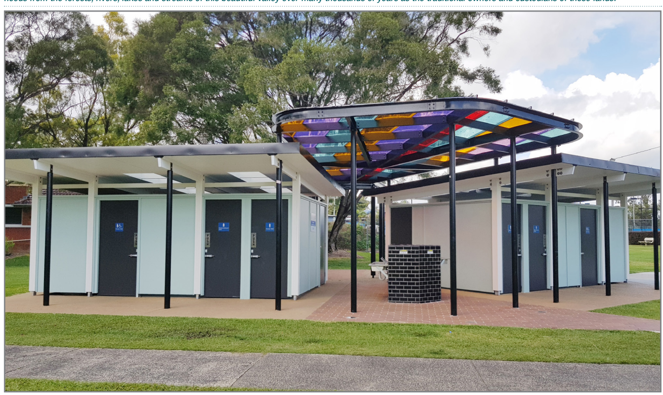
Council's new Public Toilet Strategy will ensure well-maintained, safe, conveniently located and accessible public toilets across the Tweed.

Tweed Shire Council wishes to recognise the generations of the local Aboriginal people of the Bundjalung Nation who have lived in and derived their physical and spiritual needs from the forests, rivers, lakes and streams of this beautiful valley over many thousands of years as the traditional owners and custodians of these lands