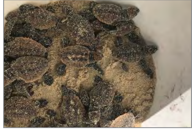
Loggerhead turtle hatchlings face many challenges to survive.

On Wednesday 14 April, hatchlings were discovered on the surface