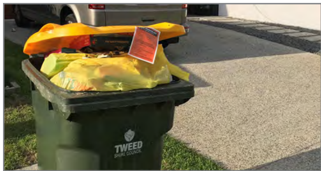
Contamination sticker attached to a recycling bin (with bagged waste inside) and not collected.

increases greenhouse gas emissions and has a negative impact on the Tweed's internationally significant environment.