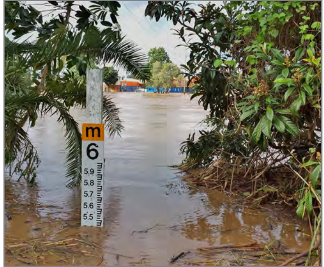
In 2017 ex-Tropical Cyclone Debbie brought widespread flooding to the Tweed. A flood level marker is pictured at Murwillumbah.

High levels of contamination increases the cost to process waste,