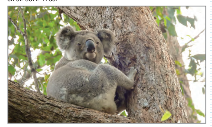
Koalas are active now and regularly cross Tomewin Road.

If you do accidentally hit or see an injured animal on the road, please phone the 24-hour Friends of the Koala rescue hotline on 02 6622 1233 or the 24-hour Tweed Valley Wildlife Carers rescue line on 02 6672 4789.