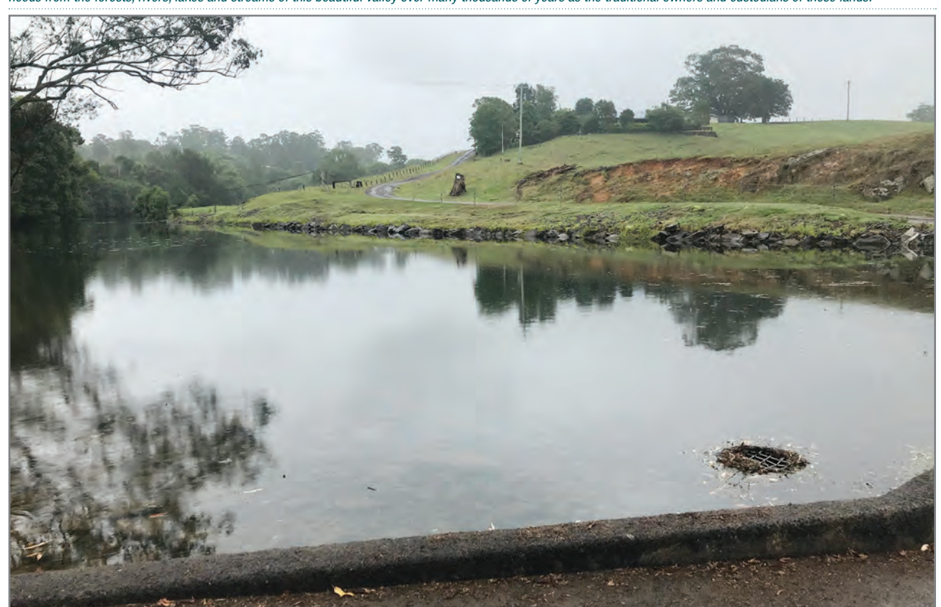
Level 2 water restrictions have been introduced at Tyalgum because of the small supply in Tyalgum Weir and low flows in the Oxley River.

Tweed Shire Council wishes to recognise the generations of the local Aboriginal people of the Bundjalung Nation who have lived in and derived their physical and spiritual needs from the forests, rivers, lakes and streams of this beautiful valley over many thousands of years as the traditional owners and custodians of these lands