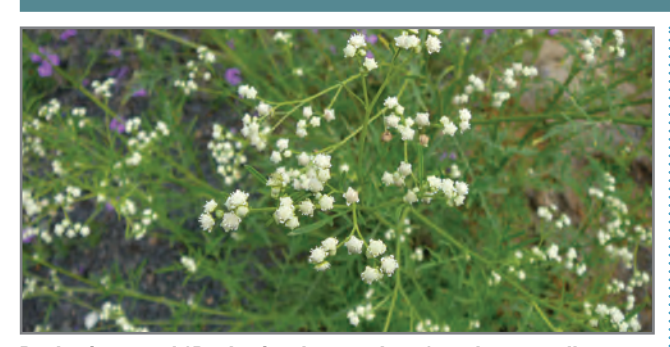
Parthenium weed (Parthenium hysterophorus) produces small innocuous flowers that can have negative health effects on humans and livestock.