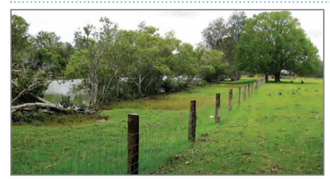
Fencing on Lower Bilambil Creek assists waterways health.

All Abergeldie contractors can be identified by the company logo on their hard hats and company name on their shirts.