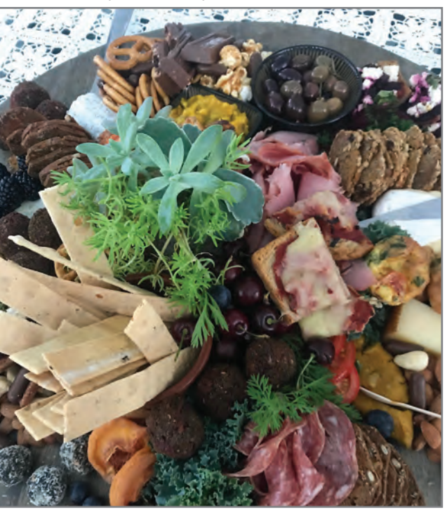
Learn how to make your own yummy and sustainable grazing platter at a free online workshop on Wednesday 16 December.

These workshops are free and brought to you by NE Waste and the Love Food Hate Waste program – a NSW Waste Less Recycle More initiative funded by the waste levy.