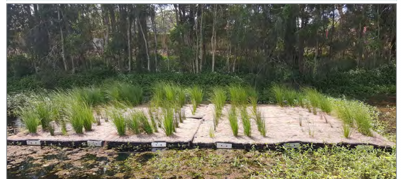
Reed beds at Banora Point help reduce environmental impact.

Tweed Shire Council wishes to recognise the generations of the local Aboriginal people of the Bundjalung Nation who have lived in and derived their physical and spiritual needs from the forests, rivers, lakes and streams of this beautiful valley over many thousands of years as the traditional owners and custodians of these lands