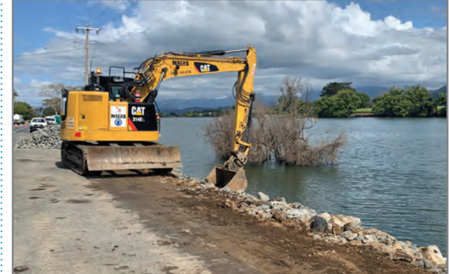
Repairs were carried out to fix a land slip into the Tweed River.

If you would like to discuss further or need any more information contact Council on 02 6670 2400.