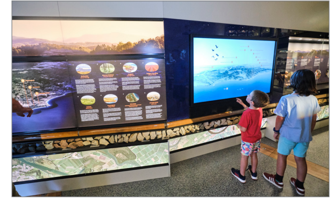
Exploring the free Land | Life | Culture exhibition at Tweed Regional Museum in Murwillumbah