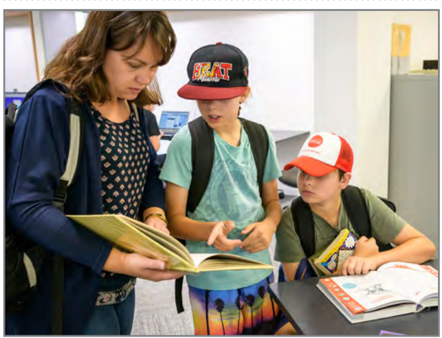
A Tweed Heads family collecting books via the Click and Collect Service from their local library.

Some councils have reported a 50 per cent increase in sewer blockages due to wet wipes and other non-flushables going down the loo during the current pandemic.