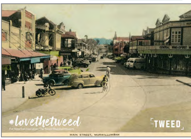
Historic Murwillumbah features in the latest digital jigsaw puzzle available for free online.

Check out #LoveTheTweed at visitthetweed.com.au/lovethetweed