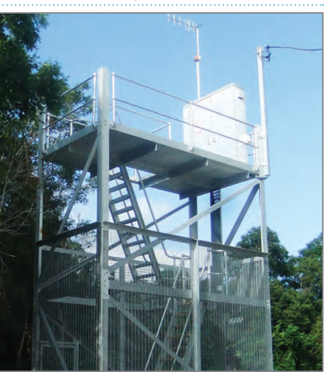
Raised pump station platform on Tree Street, Bray Park.

Meanwhile, Leisure Drive nightworks have been delayed due to rain.