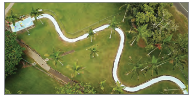
Enjoy the giant waterslide over summer at Tweed Regional Aquatic Centre Murwillumbah.