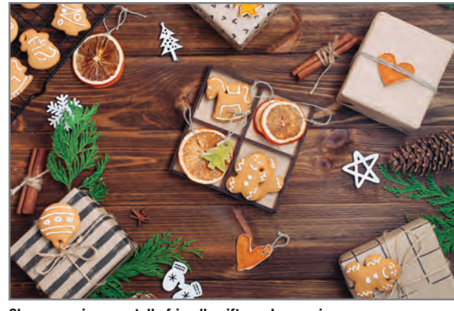
Choose environmentally friendly gifts and wrapping.

The strategy is on public exhibition until 30 January 2020 and Council welcomes community feedback. To make a submission or for more information, visit the project page at www.yoursaytweed.com.au/communitydevelopment