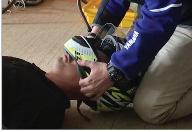
The course will teach how to remove the helmet of a crashed rider.

Council is sponsoring a free first aid and low-risk riding course for motorcyclists to raise awareness around this group of road users during National Motorcycle Awareness Month.