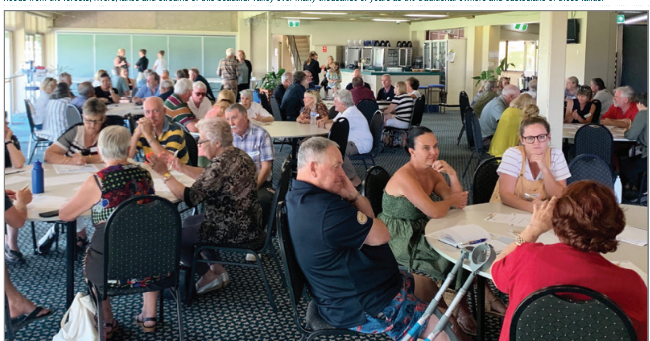
Plenty of interested locals participated in the Community Conversation on the future vision for Chinderah.

Tweed Shire Council wishes to recognise the generations of the local Aboriginal people of the Bundjalung Nation who have lived in and derived their physical and spiritual needs from the forests, rivers, lakes and streams of this beautiful valley over many thousands of years as the traditional owners and custodians of these lands