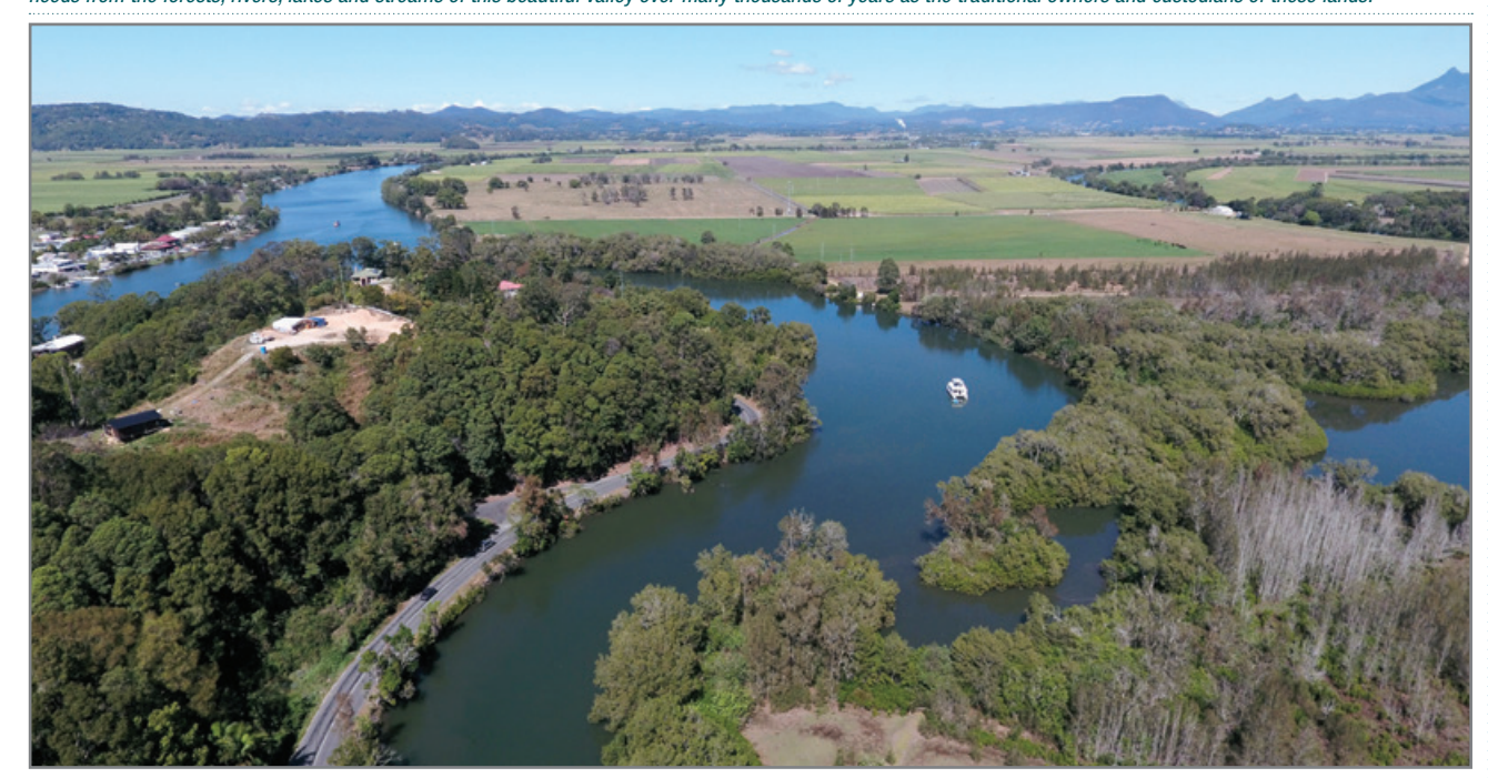
Rivers in the Tweed, including the Rous and Tweed rivers, are an important aspect of life for the community.

Tweed Shire Council wishes to recognise the generations of the local Aboriginal people of the Bundjalung Nation who have lived in and derived their physical and spiritual needs from the forests, rivers, lakes and streams of this beautiful valley over many thousands of years as the traditional owners and custodians of these lands