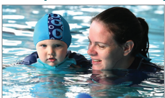
The benefits of learning to swim at an early age are many and varied.

The benefits of swimming are endless and aren't just limited to