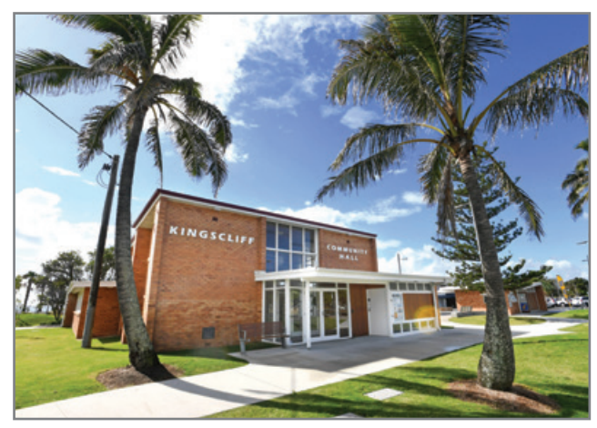
The Kingscliff Community Hall and Amenities building has won accolades

To book a community hall visit tweed.bookable.net.au