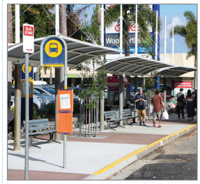
We want to know what you think about the state of your local bus stops. The survey will help us identify and prioritise improvements across the Tweed. The survey closes on 16 October. Take the survey at www.yoursaytweed.com.au/tweed-shire-bus-stop-survey