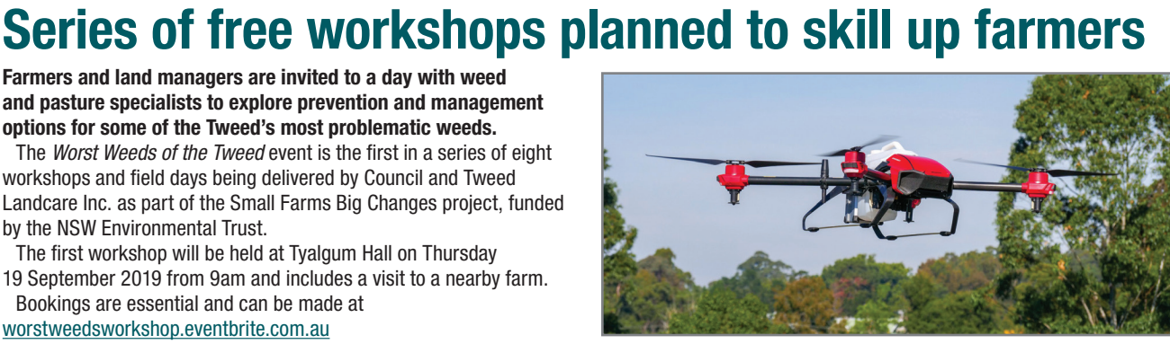
The workshop will feature demonstrations of weed control on farms using drones.