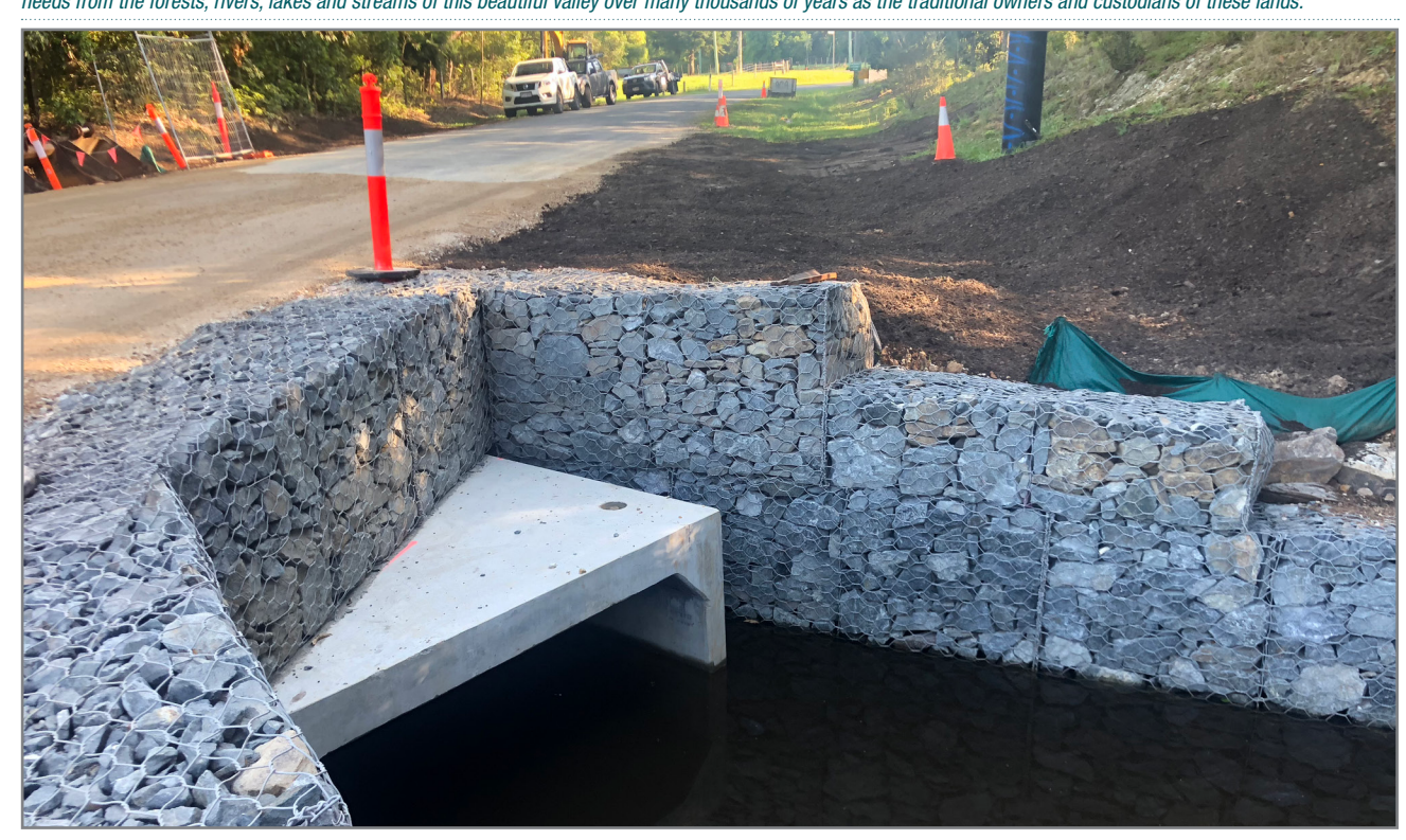
This work at Heron Road, Burringbar is an example of the types of major repairs required on Tweed's roads following the 2017 flood event.

Tweed Shire Council wishes to recognise the generations of the local Aboriginal people of the Bundjalung Nation who have lived in and derived their physical and spiritual needs from the forests, rivers, lakes and streams of this beautiful valley over many thousands of years as the traditional owners and custodians of these lands