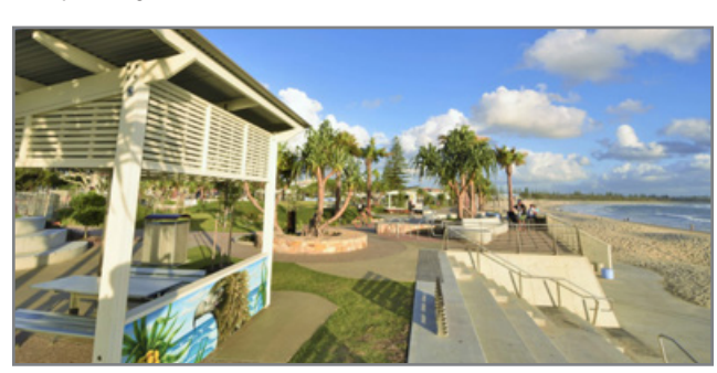
The view north from Rowan Robinson Park, Kingscliff.

The Kingscliff Foreshore Revitalisation project has been shortlisted in the upcoming NSW Local Government Excellence Awards.