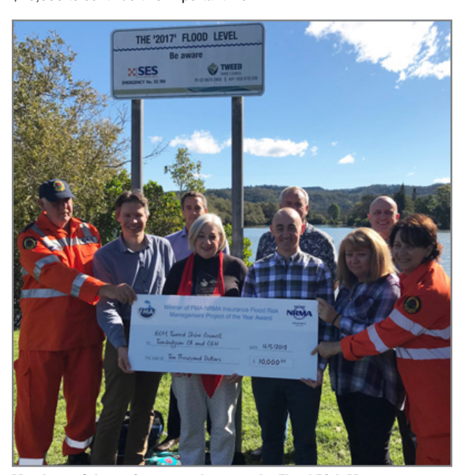
Members of the project team that won the Flood Risk Management Project of the Year Award in Tumbulgum.

As the winner of the Excellence Award, the project team will receive $10,000 to continue this important work.