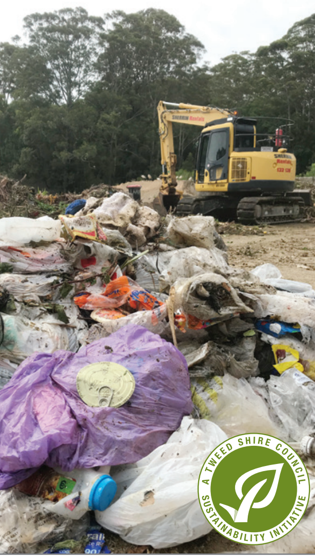
Incorrect waste put into the green organics bin has to be removed by hand at an extra cost to Tweed ratepayers.