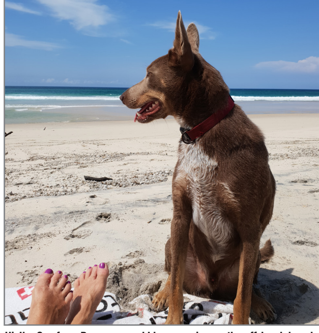
Hi, I'm Sox from Bogangar and I love running on the off-leash beach at Cabarita South. It's such a great beach and there's loads of space I'm just not allowed in the dunes because there's lots of endangered shorebirds and wildlife around here. There are four off-leash beaches in the Tweed and Council has developed a handy mapping tool which shows leash free areas and zones where dogs need to be on a lead http://bit.ly/TweedDogMapping