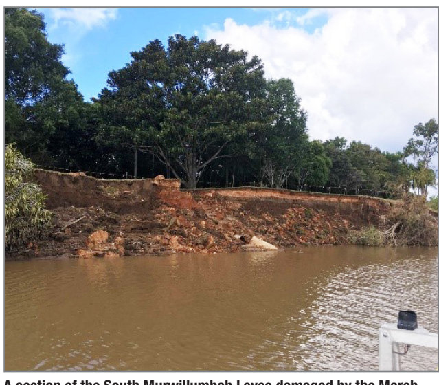
A section of the South Murwillumbah Levee damaged by the March 2017 flood.

Council hopes reconstruction works will start in about July and take four months to complete.