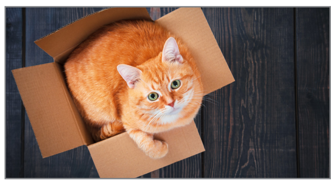
Help Council advocate for cat welfare and wildlife protection by joining the Feline Friends focus group.

Are you a cat owner over the age of 18 years living in the Tweed? Then Tweed Shire Council invites you to volunteer to participate in a Feline Friends focus group.