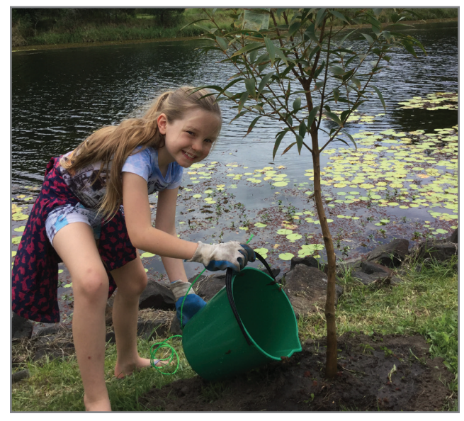
Make a difference by coming along to another family planting day the Western Drainage Scheme at Banora Point on Saturday 23 March.

And if you want to be more involved in local environmental projects, CVA is looking to establish a Banora Point Landcare group. Contact Shae to find out more.