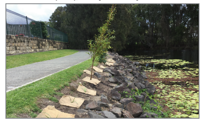
Some of the great work that's already been achieved on the Western Drainage Scheme.

In conjunction with Council's improvements through structural works to remove shallow points and extending floating reed beds, working bees are held every Friday, meeting at 9am along Avondale Drive.