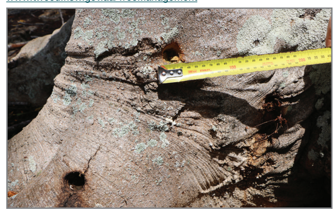
Multiple holes were drilled in six mature poinciana trees, which were then poisoned.

For more information on trees on Council land, visit www.tweed.nsw.gov.au/TreeManagement