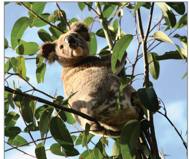
Koala habitats are on the agenda with changes proposed to the Kings Forest plan of management.

To book in to speak or for more information visit www.ipcn.nsw.gov.au/projects