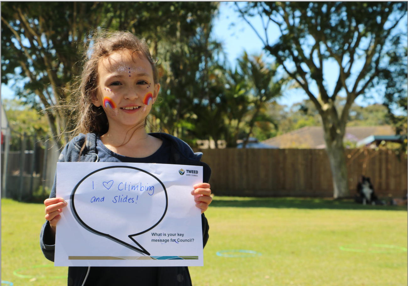
A young local tells us what she'd like to do in the new Eunga Street Park.