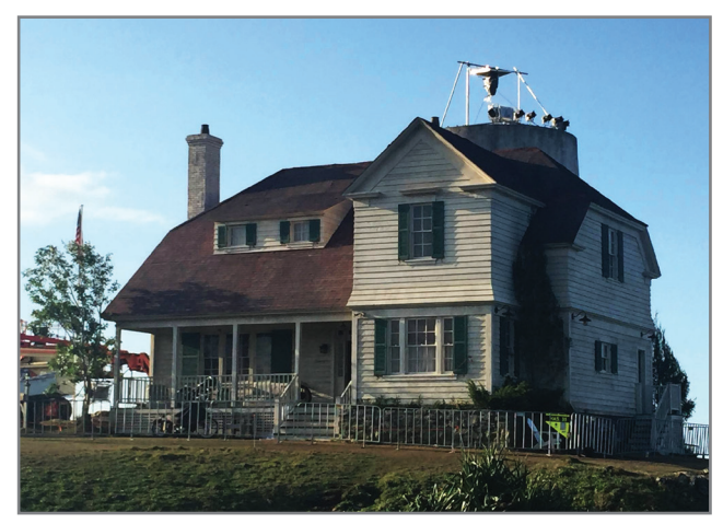
Recognise this house from the blockbuster Aquaman? The set was constructed on the headland at Hastings Point.

Find out why Murwillumbah is the perfect place to spend a day out with all the family at www.tweed.nsw.gov.au/Holidays