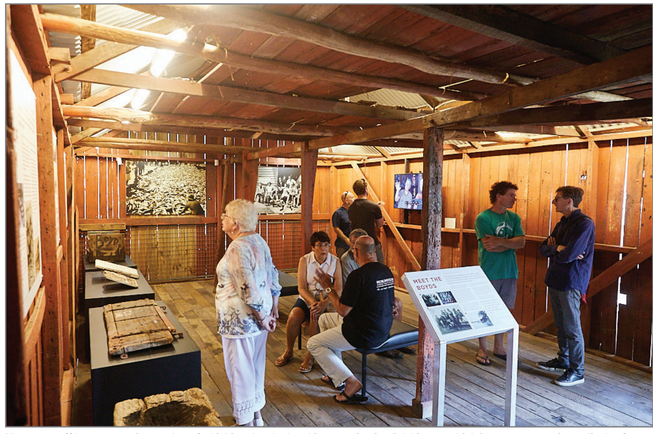
Museum staff have spent six months refurbishing the shed and interpreting its rich history which is now once again on display for a new generation of visitors to enjoy.