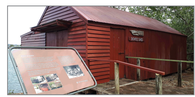
Explore the heritage-listed Boyds' Shed at the Tweed Heads branch of the Tweed Regional Museum, the base for the family's commercial fishing operations from the 1920s to the 1960s.

The Tweed Heads branch of the Museum is open every Tuesday, Wednesday, and Sunday from 10am to 4pm (NSW time). For more information visit museum.tweed.nsw.gov.au