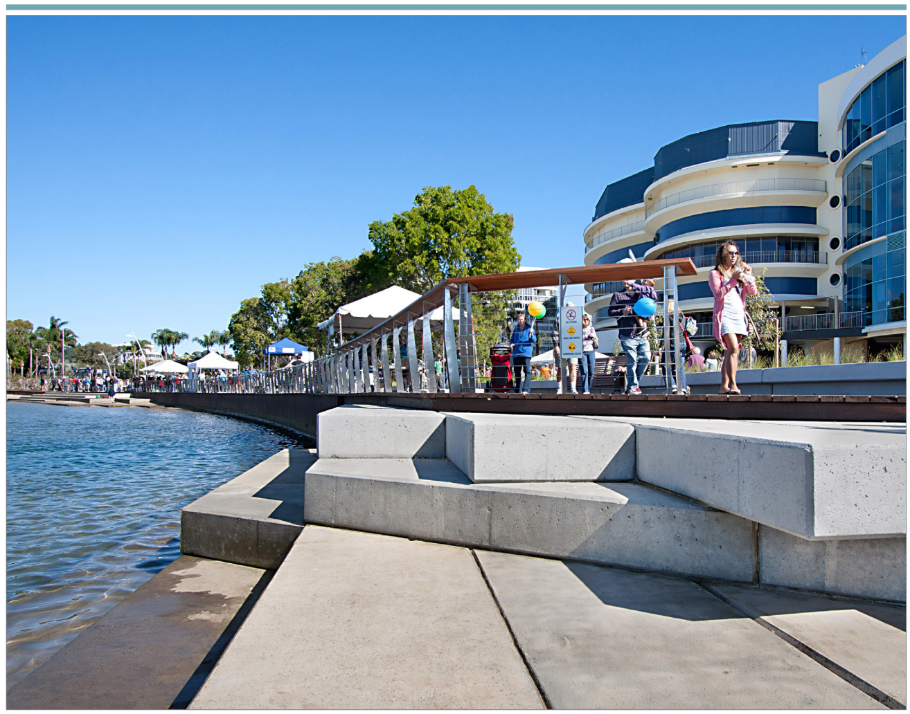
Council would like to hear your thoughts on how Jack Evans Boat Harbour can best fulfil its potential.