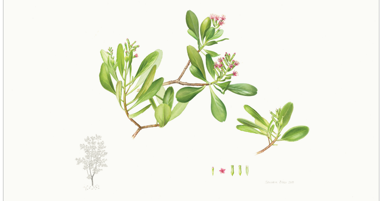
Deirdre Bean, Lumnitzera \times rosea 2015, watercolour and graphite on Arches 300gsm hot pressed paper 43 \times 30cm.

For more information visit <a href="www.tweed.nsw.gov.au/AustraliaDay">www.tweed.nsw.gov.au/AustraliaDay</a>