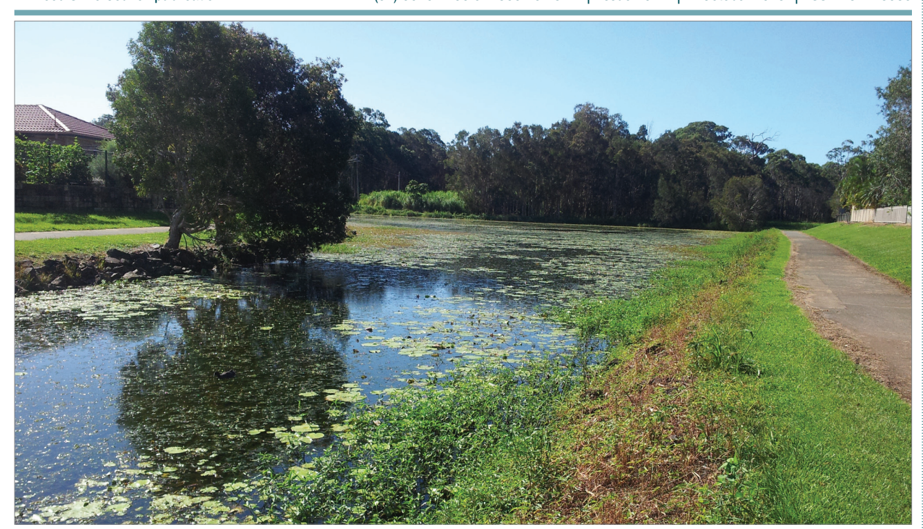
Riversdale Boulevard, the site of the first Community Planting Day to contribute to improving the health of the Western Drainage Scheme.

(02) 6670 2400 or 1300 292 872 | Issue 1074 | 2 October 2018 | ISSN 1327-8630