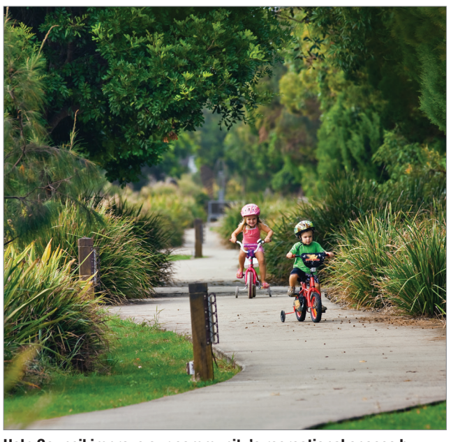
Help Council improve our community's recreational spaces by telling us your thoughts on the draft Open Space Strategy.

To view the draft Homelessness Policy and to have your say, visit <a href="www.tweed.nsw.gov.au/onexhibition">www.tweed.nsw.gov.au/onexhibition</a>