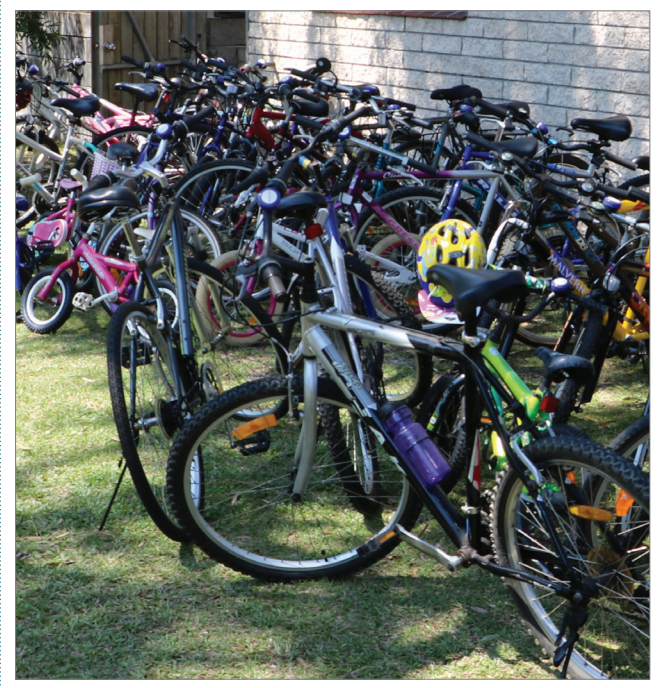
Some of the 44 donated bikes which will be back on the road, thanks to community generosity.

Demolition of the first batch of houses purchased began last week