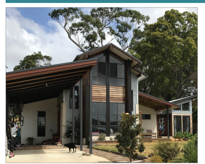
Do you have a sustainable house and want to share your tips with others?

Most people know that councils are responsible for rates, roads and rubbish but did you know Tweed Shire Council