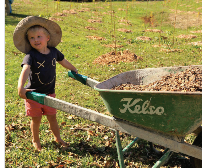
This young fellow probably needed a bit of hand with this massive mulch load!