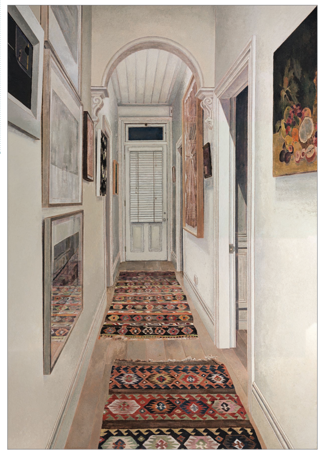
Cressida Campbell, Hallway with kilims, 2017–18, 120 × 80cm. © Cressida Campbell/Licensed by Viscopy, 2018.

Download our stallholder information and application from www.tweed.nsw.gov.au/HomeExpo