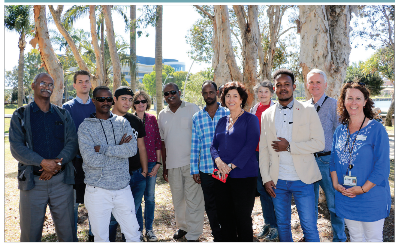
Refugees from the local area, members of the Uki Refugee Project and Council staff spent a day exploring the Tweed, in recognition of the Tweed's status as a Refugee Welcome Zone.

(02) 6670 2400 or 1300 292 872 | Issue 1066 | 7 August 2018 | ISSN 1327-8630