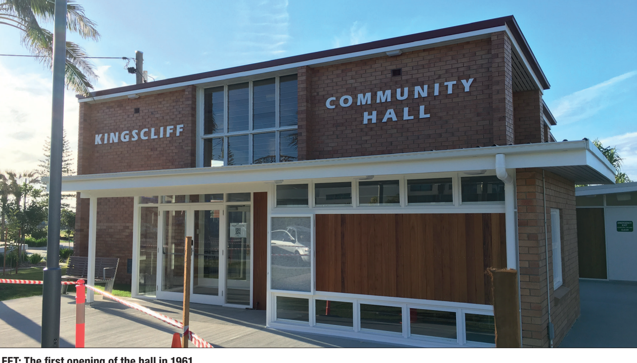
LEFT: The first opening of the hall in 1961. ABOVE: The much-loved Kingscliff Hall is about to have a party to celebrate its makeover and you're invited.