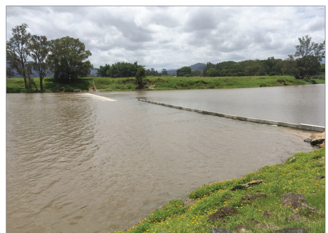
Bray Park weir is temporarily narrowed using concrete blocks ahead of threatening high-tide events.