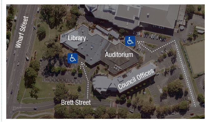
Map of the accessible car parking spaces at the library.

Nominations are open until Friday 28 September 2018. Winners will be announced at an event at Seagulls Club on 3 December, which is International Day of People with Disability.