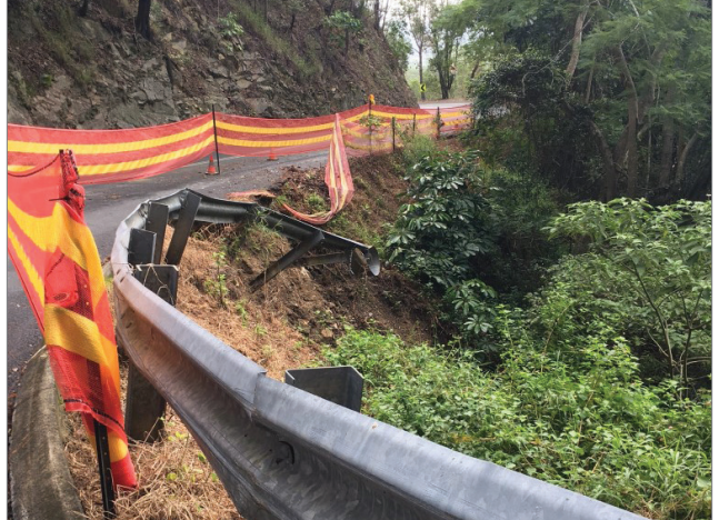
The site of the major landslip on Clothiers Creek Road.

For more information, phone Council's Waste Management Unit (02) 6670 2400.