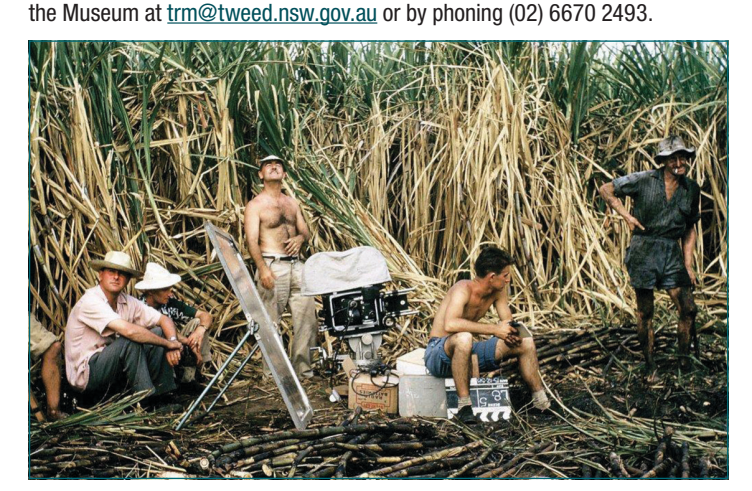
Film crew members waiting for the light at a Tweed cane field.

Old and Gold screens at Tweed Regional Museum Murwillumbah from 5.30pm. The Tweed on Film exhibition continues until Saturday 25 November. Admission is free but bookings are essential and can be made by contacting