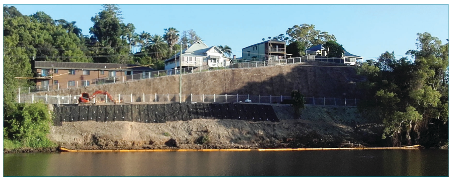
The view from across the river shows the depth of the embankment and the scope of the riverside stabilisation works. Jute matting will be placed below the mesh and wire shown above.

Roadworks will be started but are unlikely to be completed by Christmas. The road base has to be built up with the importation of materials, before kerb and gutter is laid and then the road built. Any wet weather will hamper progress and it is likely the new road will not be completed until early 2018.