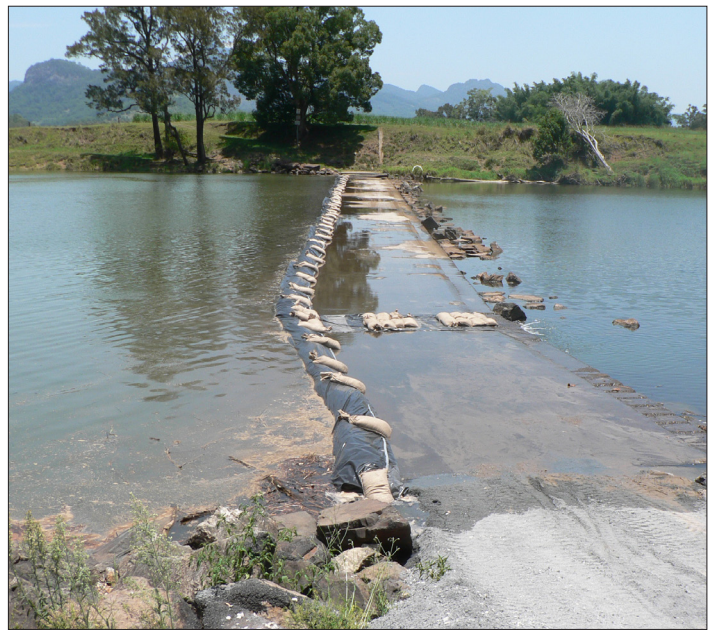
The Bray Park Weir wall is usually sandbagged when very high tides are expected. Unfortunately, the predicted peak was well exceeded last Monday, and salt water entered the weir pool.

"We are very appreciative of the huge effort of the community, our staff