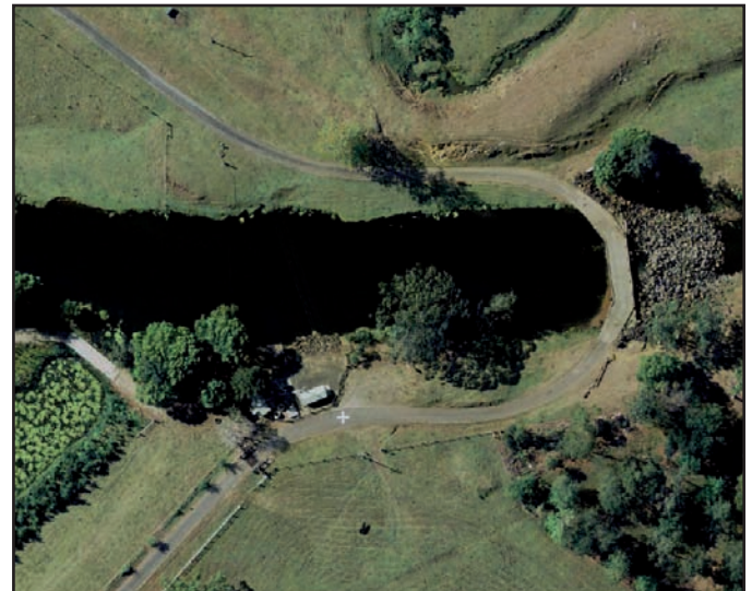
The existing Tyalgum Water Treatment Plant and weir.