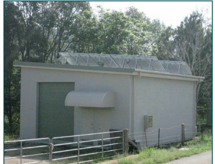
A new building has been completed as a part of the water treatment plant upgrade.

The new WTP will improve water quality to meet Australian Drinking Water Guideline requirements, producing up to 250kL/d of very high quality potable water, and will eliminate the need to cart water during periods of poor raw water quality.