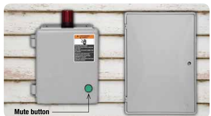
The pump station's control box normally is near the electricity meter box.