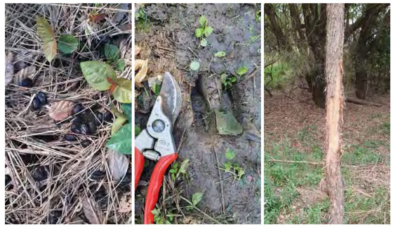
Figure 1 Deer scats, tracks, damage

The benefit of collecting informal records of deer on your property will show seasonal and annual fluctuations in the sizes and freshness of scat piles, the number of tree rubs or the signs of plant damage, and will indicate whether deer numbers are increasing or decreasing.