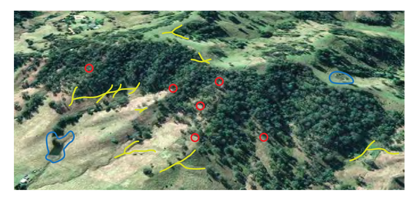
Figure 2 An example of habitat areas to inspect for signs of deer: Multiple tracks and trails intersecting (O), dams and springs – drinking water and wallowing (O) and priority locations – bedding, sunning and lekking (gathering of males during the rut) (O).

The benefit of collecting informal records of deer on your property will show seasonal and annual fluctuations in the sizes and freshness of scat piles, the number of tree rubs or the signs of plant damage, and will indicate whether deer numbers are increasing or decreasing.