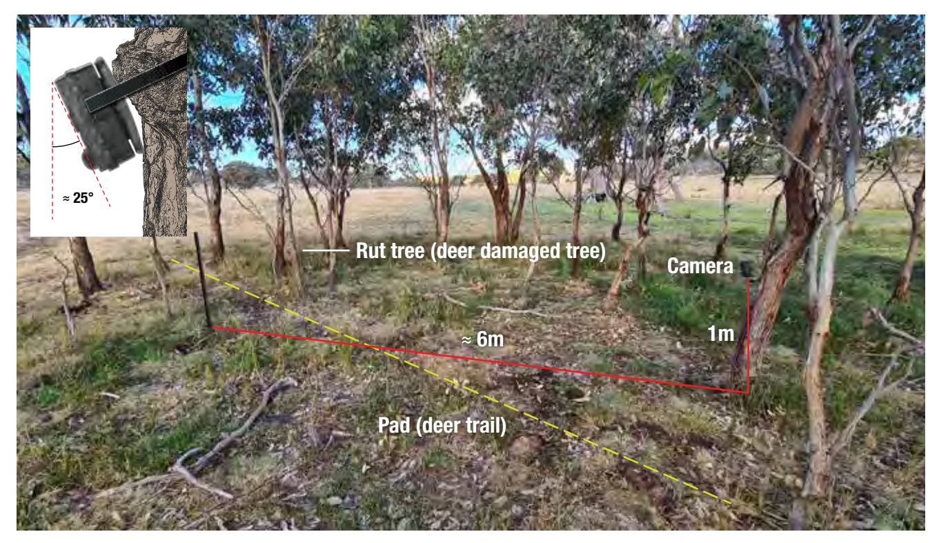
Figure 3 An example of a camera installation. This location was selected due to its proximity to a tree damaged by deer. Inset: Cameras should be angled at approximately 25° down and away from the sun, favourably facing north or south.

Once installed and set up is complete, turn the camera on and arm the camera. Leave the camera in place for as long as possible, at least 2 weeks. It is recommended you check the batteries and change the SD card regularly.