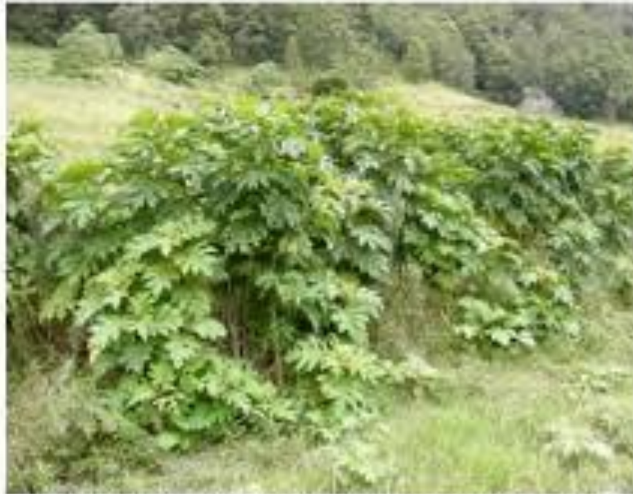
Giant devil's fig establishing in pasture.