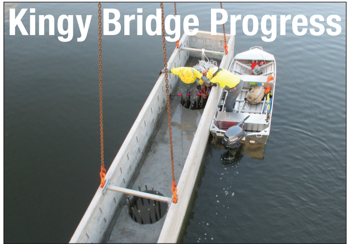
ABOVE: Last Thursday a crane lifted the tub into position in the middle of the Cudgen Creek channel and workers fitted it over the centre piles and butted it up to the pile cap of the existing pedestrian footbridge to form one centre pile for the combined Kingscliff Bridge.