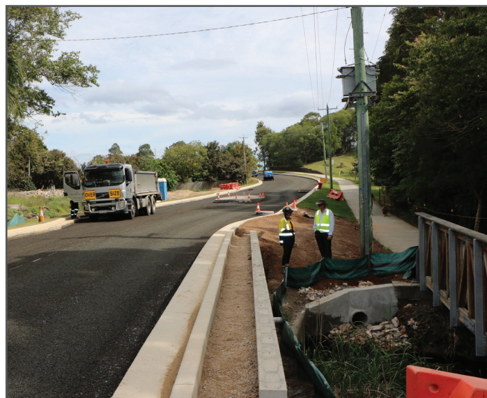
Council Environmental Scientist Sally Cooper discusses options to revegetate the small area around the culvert within the Koala Zone with Construction Engineer Bob Hanby. The slow point median can be seen in the centre of the picture, which was taken prior to the road upgrade being completed.

Two solar street lights are yet to be installed to assist motorists to see any koalas that may be on or approaching the road.