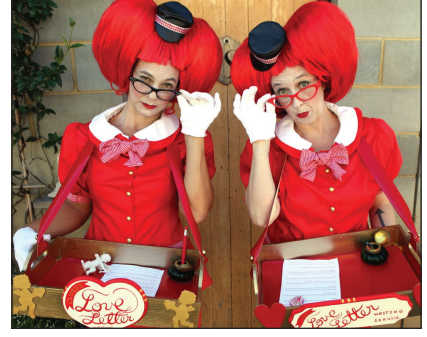
The Valentines by Roundabout Theatre.

Council has confirmed funding for two new public artworks in Murwillumbah and Kingscliff and is asking the community members to share the themes they would like to see reflected in these works.