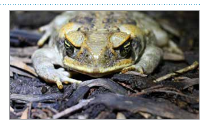
Join in the Cane Toad Challenge next month.

For more information contact canetoads@watergum.org