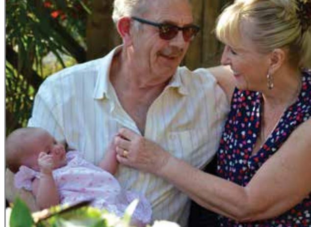
Become a savvy senior by hearing from the experts at the Ageing Smarter Q&A.

"Every story is important. You may have had to evacuate quickly due