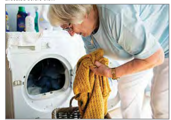
A water and energy efficient washing machine could save you $270 a year.

Visit water.dpie.nsw.gov.au/plans-and-programs/water-efficiency/ washing-machine-replacement-trial to apply for the grant. Be quick! Applications close 30 September 2022, unless all machines are allocated before then