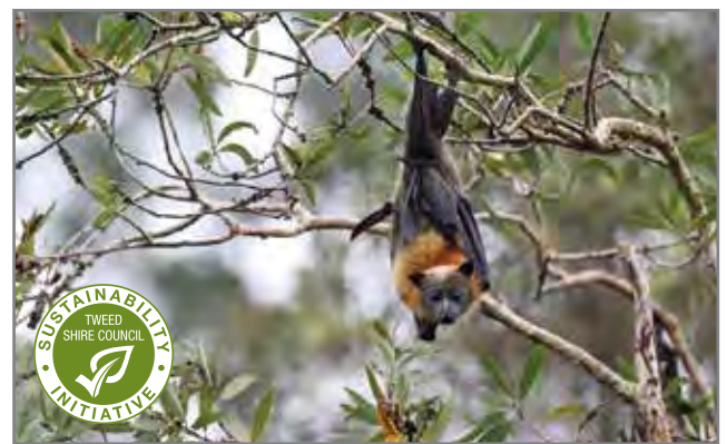
The grey-headed flying-fox is Australia's largest flying-fox with a wingspan of up to 1 metre.

Visit tweed.nsw.gov.au/native-animals to find out more about the Tweed's flying-foxes at or about Council's Biodiversity Grants Program at tweed.nsw.gov.au/environmental-grants-incentives. Read the full media release at tweed.nsw.gov.au/latest-news